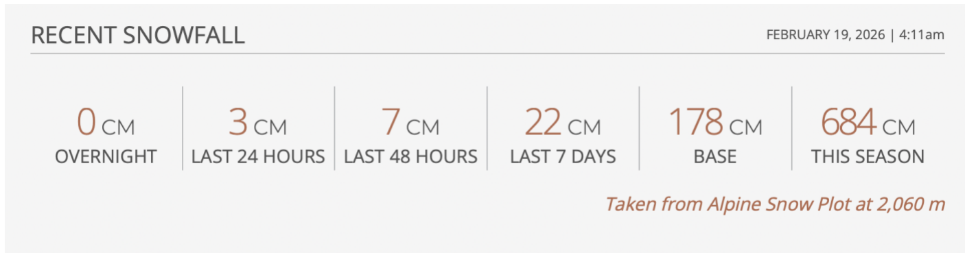
KHMR snow report screenshot on Feb 19