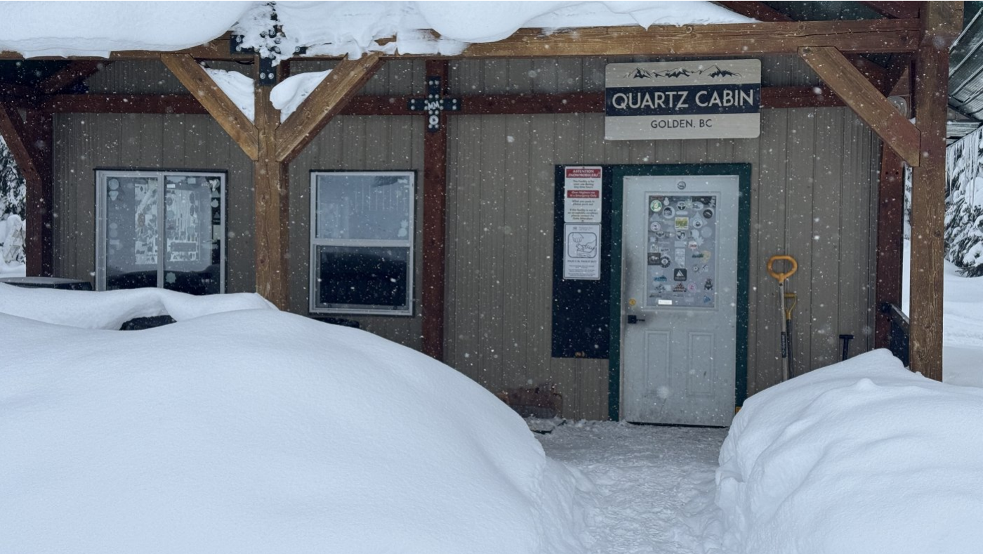
The stairs to Quartz cabin are buried.

There is snow in the forecast and we can expect 30-40 in the next week coming up.