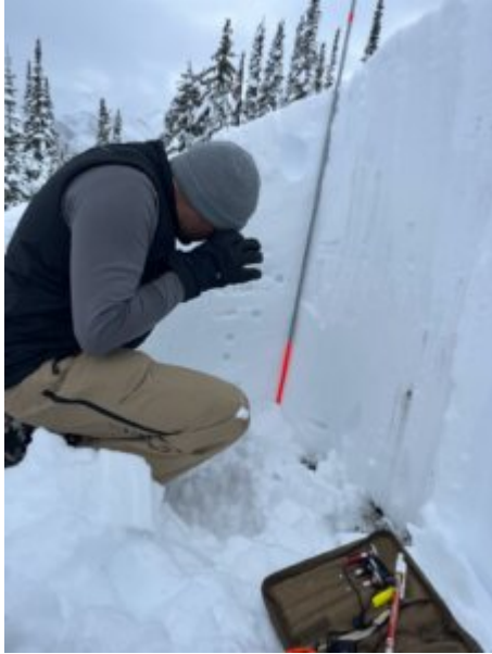
Snowpit digging near Quartz on Nov 25