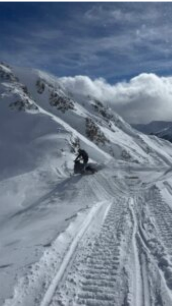
East Quartz/Lang traverse on