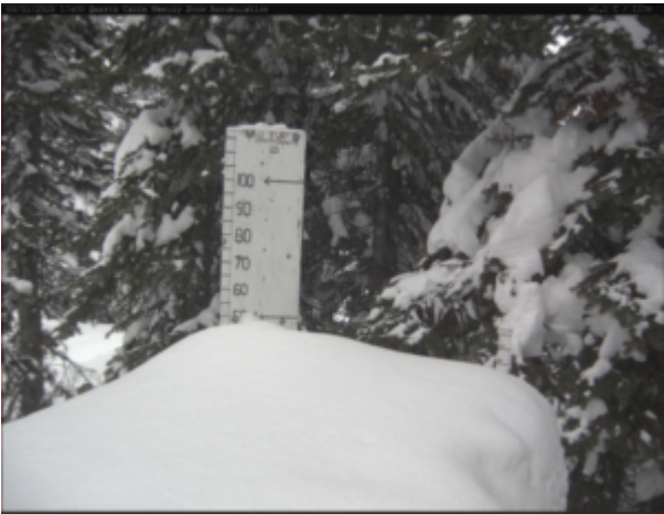
Storm board at Quartz Cabin on Mar 13