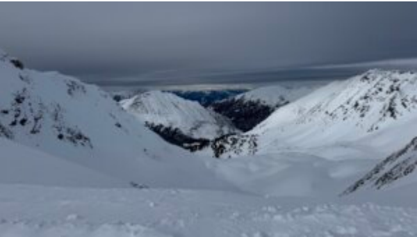
storm approaching Quartz Lake on Feb 19