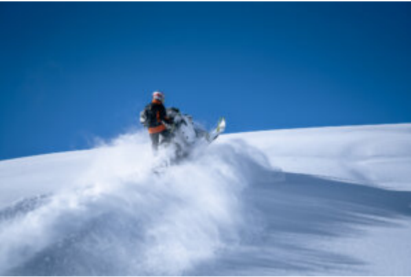
Pow in Quartz on Feb 3

make your way out here. Looks like temps will be trending warmer and hopefully that kicks off the snow again sometime soon.