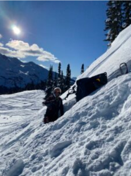
Stuck in Silent on the Jan 23