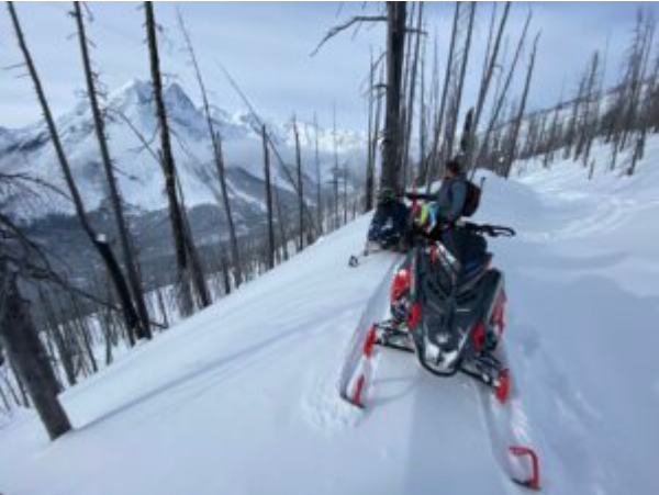
Silent Pass on Jan 23