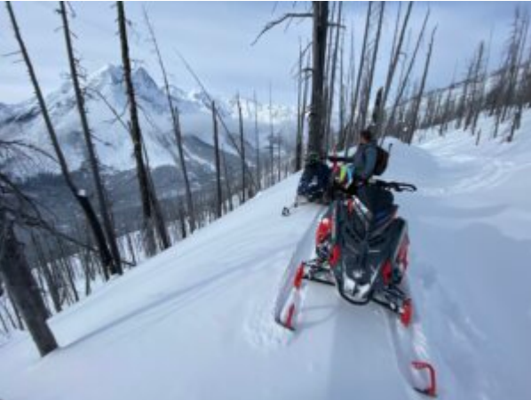
Silent Pass on Jan 23

KHMR reported 9 cms in the past week and a little bit fell today too (Jan 23). There’s not a lot snow-wise in the short term forecast so the bright side needs to be the blue sky that is going to be here this week. The temps are turning more reasonable by Sunday. Golden has had its first cold snap of the year the past week but things look to be returning to more normal winter temps this week.