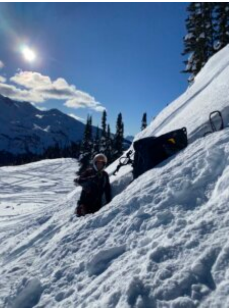
Stuck in Silent on the Jan 23