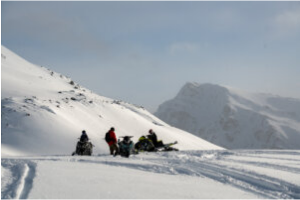
Holt Creek Jan 5