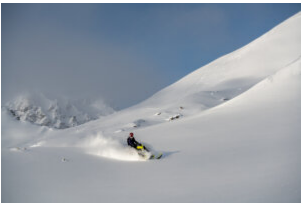
Powder in Holt on Jan 5