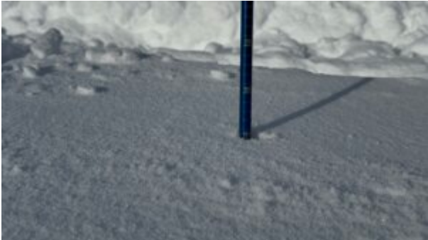
160 cms probed on the front side of Silent Pass at 2210m on Dec 22