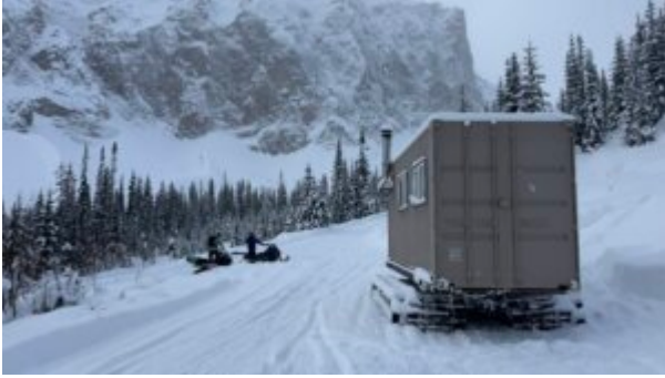
warming cabin on Dec 28