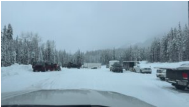
Silent Parking at km 31 lot on Dec 22