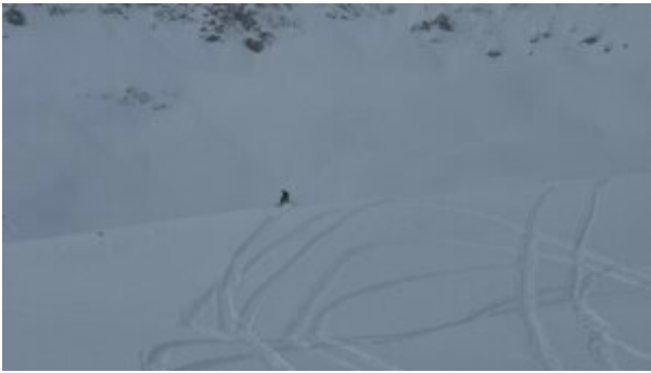
Powder in Holt on Dec 28

Whiskeyjack Logging will be hauling down from the 7.5km for the next 2-3 weeks, and until they're done PWT will continue to plow up to the top parking lot. Please be aware about the increased traffic and be extra vigilant.