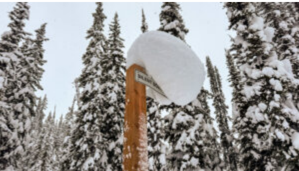
Silent Pass sign on Nov 28