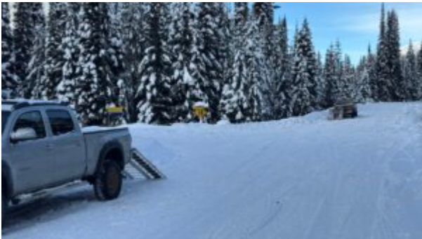
Silent Parking at the 45km McMurdo bridge