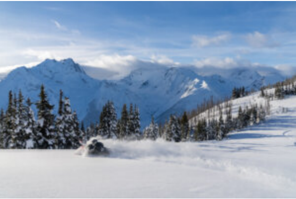
Silent Pass on Dec 3, 2024

Looks like 15-20 cms if forecast in our mountains, with the majority coming on Saturday. Temps will warm up during the storm and then look like they will cool down again after.