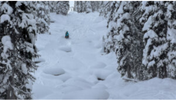
Waterfall feature on Nov 28 in Silent Pass