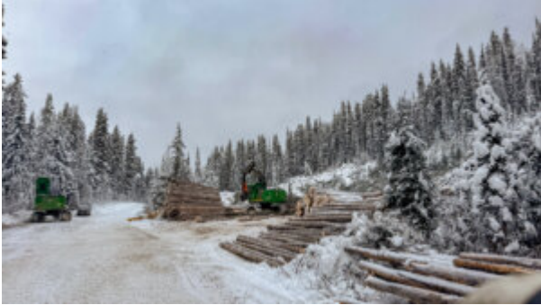
Forestry work at the 36km on North Fork

Silent is in pretty good shape. The waterfall feature is mostly in with a few bumps in it from previous stucks. The area has seen some traffic but there's still some left.