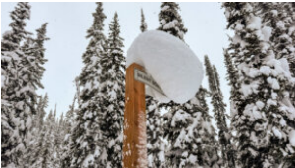
Silent Pass sign on Nov 28

The big bomb cyclone dump that we had earlier in the month delivered an excellent base for us. While the snowpack is settling to about 90-100 cms the coverage is quite good and it is supportive to sledding. There is still a lot of powder in the bowls where people haven't been playing too much. Lots of early season hazards exist so tread carefully, but this is the best early season we've had in a couple years for sure.