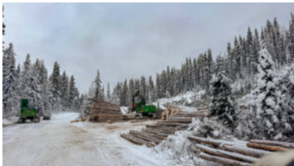
Forestry work at the 36km on North Fork