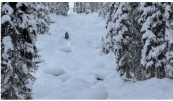
Waterfall feature on Nov 28 in Silent Pass