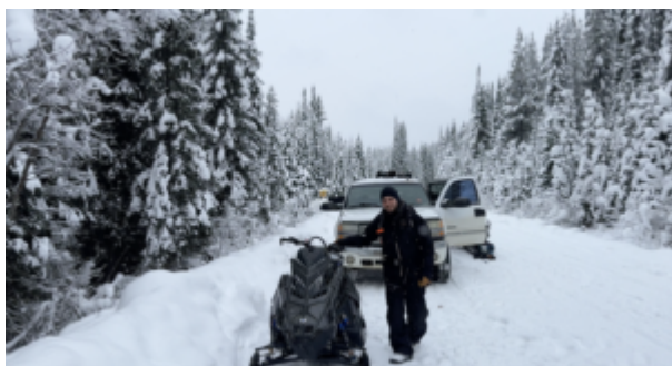
Parking at the 45km near McMurdo bridge