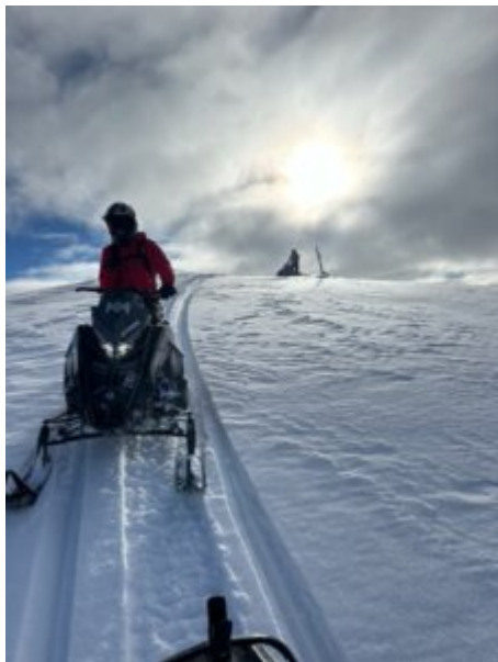
Quartz Nov 23

Good early season coverage. A lot of compaction in the main bowls. Powder if you search for it.