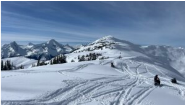
Quartz on March 15

We've had 15-20 cms in the past week and there's 26cms in the 6 day forecast (if you believe snow-forecast.com). Coverage is quite good and there's only one step up left at Quartz cabin, which is our unofficial measurement of yearly snowfalls. Sometimes there's a couple steps down to the cabin deck so this year seems to be just a little below normal but still pretty good.