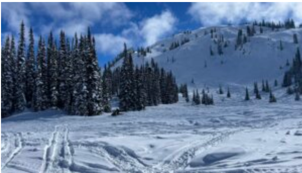
Mellow terrain in Quartz on Mar 6

We've had 20-30 cms of new snow in the past week. The weekend will be hot and sunny but it looks like things will cool down next week and more snow is expected. There's currently 26 cms in the 6 day forecast.