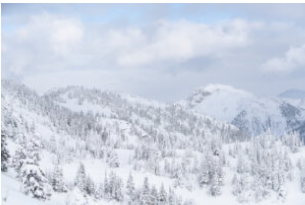
Quartz is starting to look caked on Jan 10