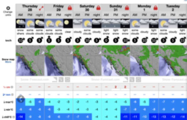
Forecast near Silent Pass area on Dec 28