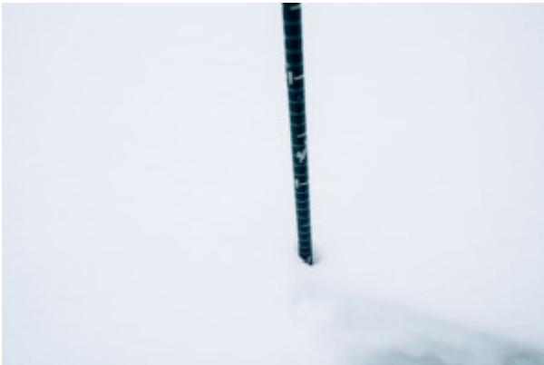
120 cm in Quartz on Dec 9