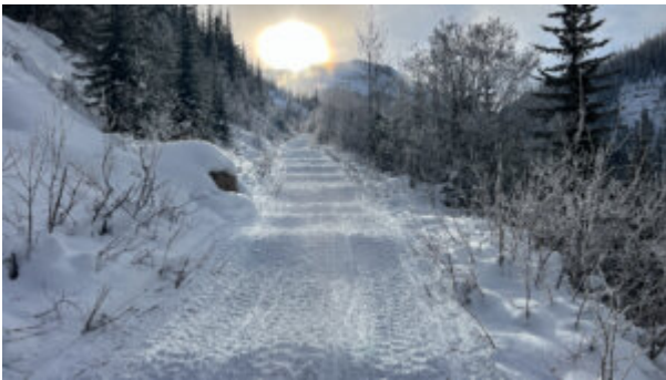
Trail in to Quartz cabin is a bit whooped.