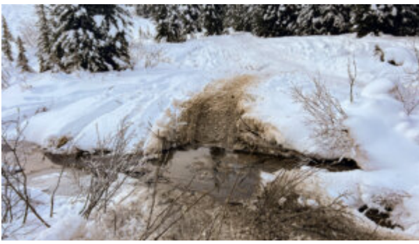
Creek crossing on way in to Quartz on Nov 27