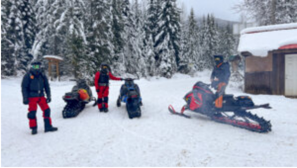
Sledding from the parking lot at Quartz is good to go.