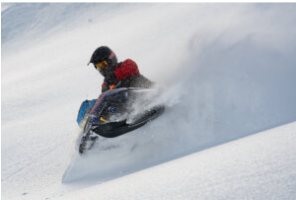
Committing to the turn on Nov 27