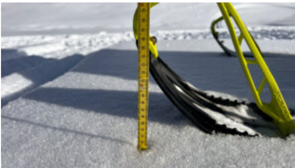
61 cms of settled snow in Quartz alpine on Nov 27

The ridable snow up in Quartz is pretty thin. There hasn't been a significant snowfall for 3 weeks. What's there is at least settled and is offering a supportive base, but we need more snow, to say the least. There's 50-60cms of compacted snow in the alpine bowls at Quartz.